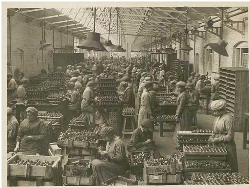
Official government photograph showing women working in a munitions factory. Women rarely did this sort of work before the war, but as men went to fight, the work women did started to change.