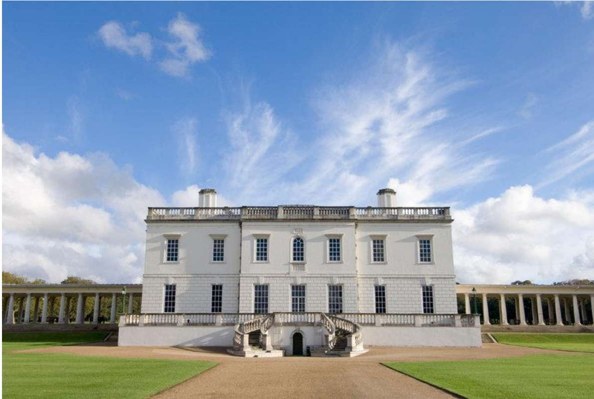
The Queen's House, Greenwich, built between 1616–1619 for Anne of Denmark