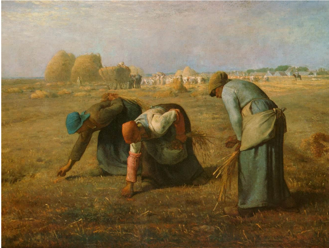
Jean-Francois Millet The Gleaners , 1857. Oil on canvas